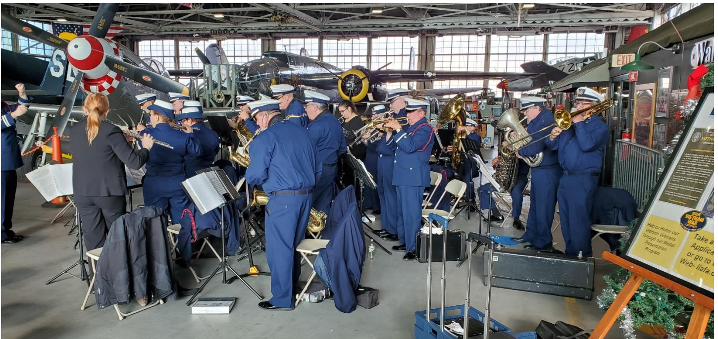
The U.S. Coast Guard Auxiliary Band, always adding so much to our ceremonies