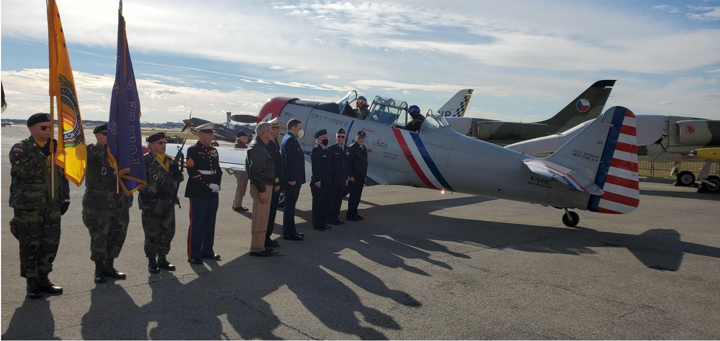
Honor guard with SNJ-2 aircraft that is preparing to take off to deliver the roses to the Statue of Liberty