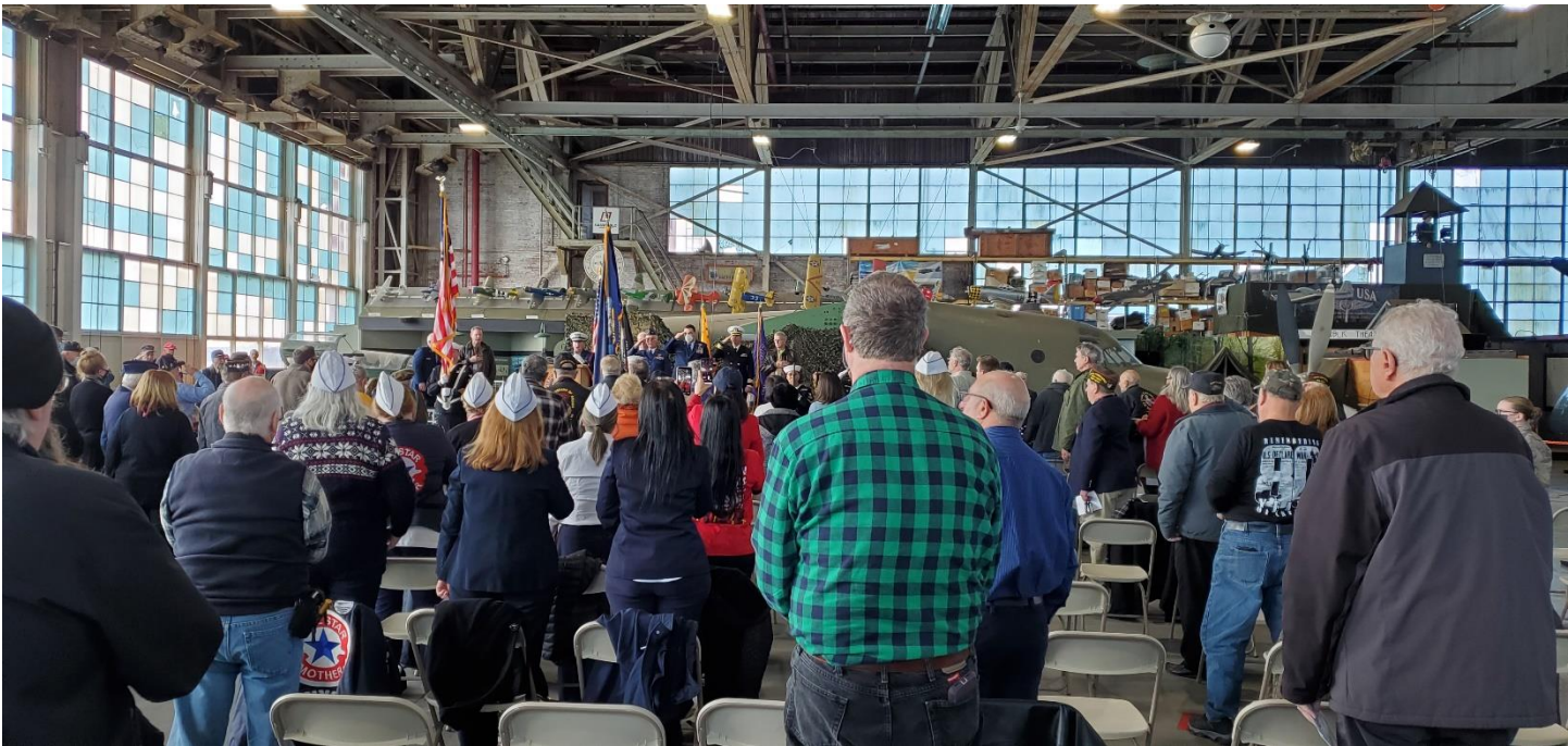
A pretty good turnout despite COVID and the ceremony being held on a workday